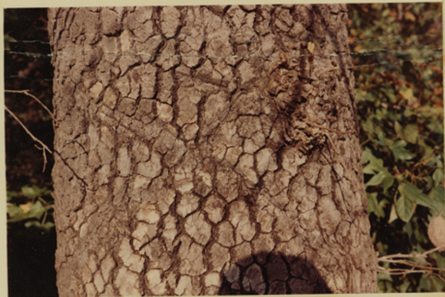
RIGHT AND BELOW - CLOSER VIEWS SHOWING OLD AND NEWER SURVEYOR'S MARKS