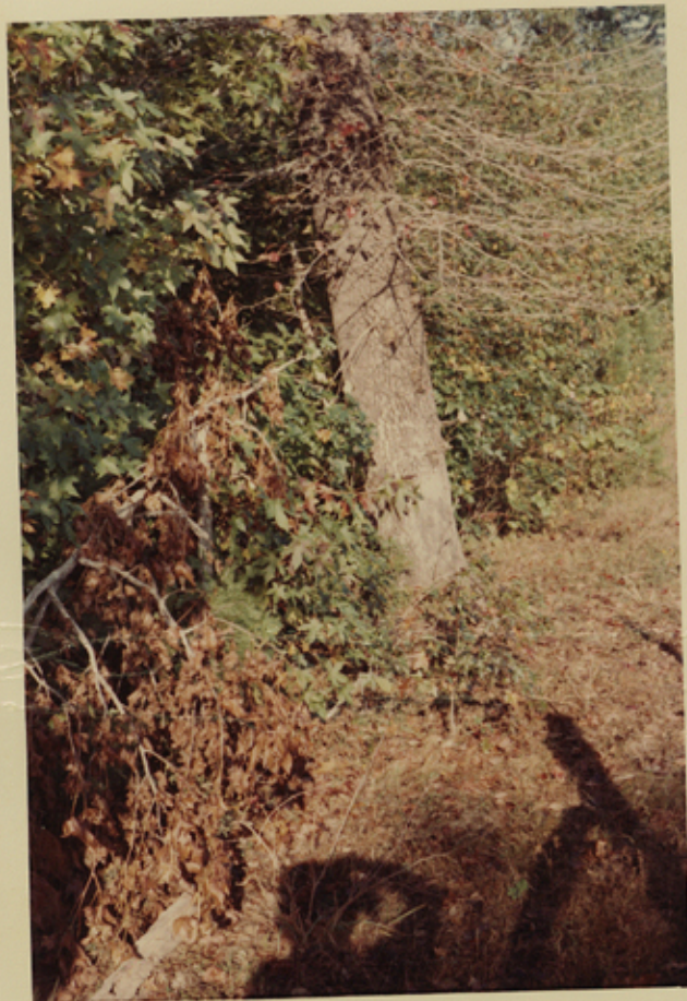
LEFT - PHOTOGRAPH WITH CAMERA AT SURVEY CORNER

PHOTOGRAPH OF ORIGINAL BLACKGUM BEARING TREE CALLED AND FOUND TO BE N. 57\frac{1}{2} W. 10 VARAS FROM McCAIN-ADKERSON CORNER IN NORTH LINE OF JAMES W. BAGGS SURVEY IN UPSHUR COUNTY, FIRST MARKED BY LOCATING SURVEYOR J. M. GLASCO ON OCTOBER 1, 1851.