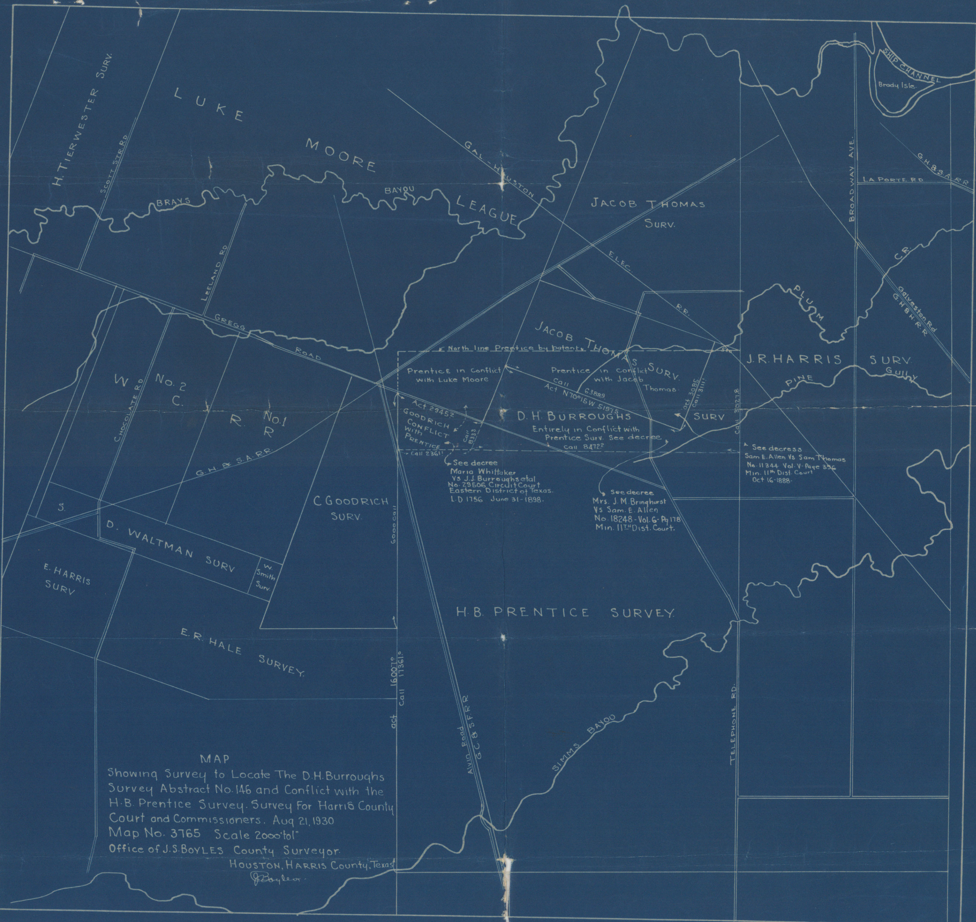
MAP Showing Survey to Locate The D.H. Burroughs Survey Abstract No. 146 and Conflict with the H.B. Prentice Survey. Survey For Harris County Court and Commissioners. Aug 21, 1930 Map No. 3765 Scale 2000' to 1" Office of J.S. BOYLES County Surveyor. HOUSTON, HARRIS County, Texas Boyles