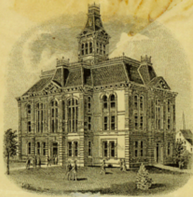
AUSTIN COUNTY COURT HOUSE.