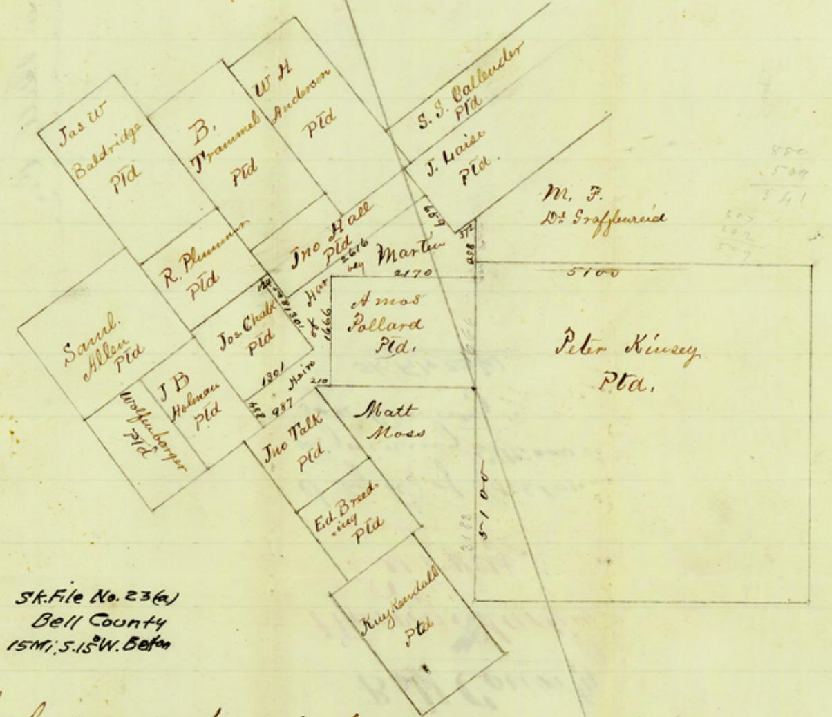
Sk. File No. 23 (a) Bell County 15 Mi. S. 15 W. Belton