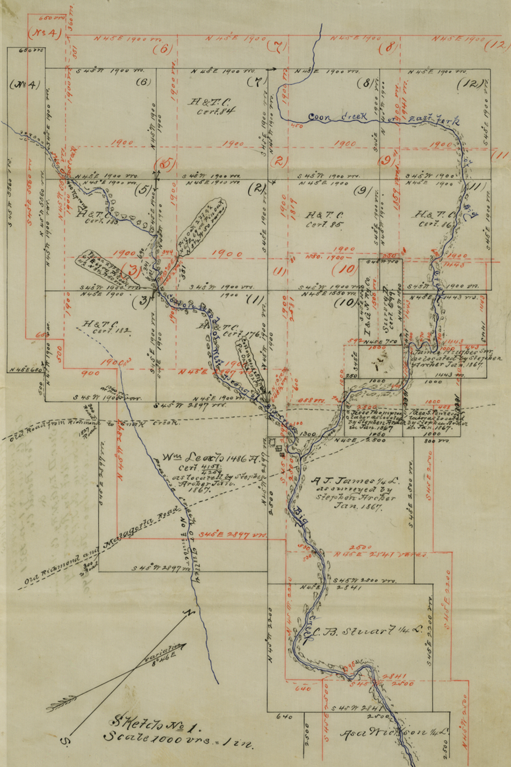
Sketch No. 1. Scale 1000 vns. = 1 in.