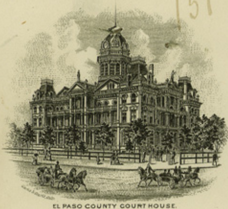
EL PASO COUNTY COURT HOUSE.