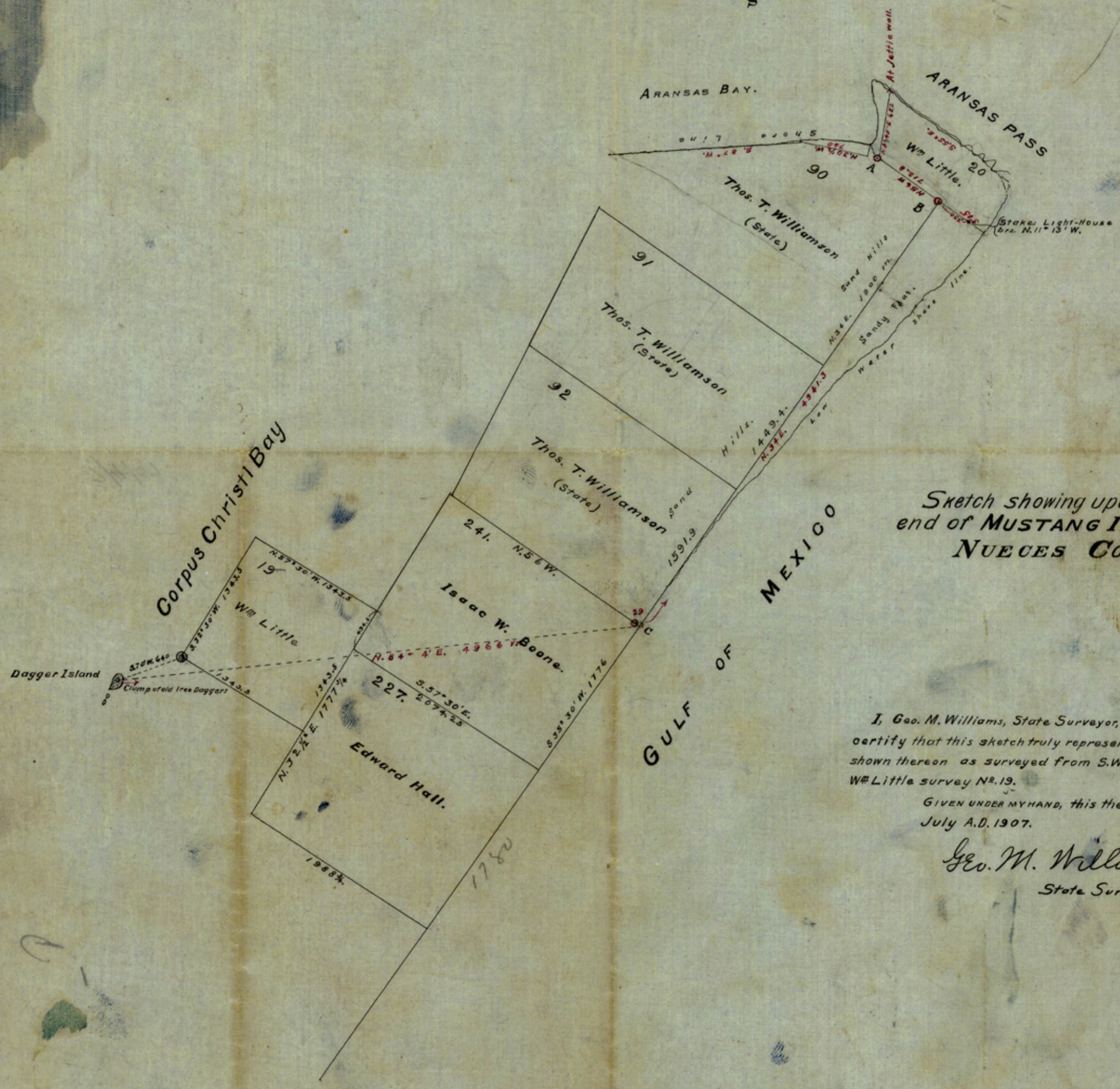
Sketch showing upper end of MUSTANG ISLAND, NUECES Co.