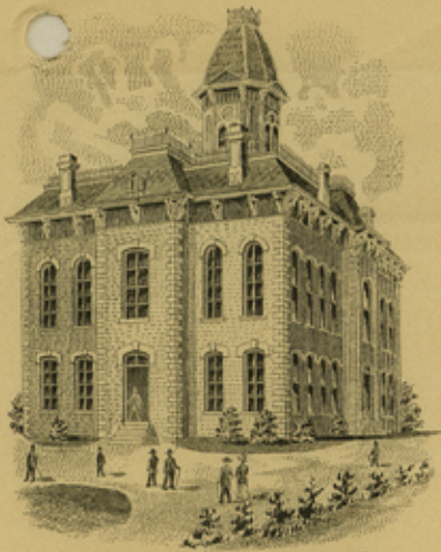
WEBB COUNTY COURT HOUSE.