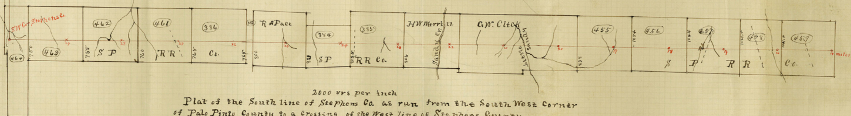
2000 vrs per inch Plat of the South line of Stephens Co. as run from the South West Corner of Palo Pinto County to a crossing of the West line of Stephens County.