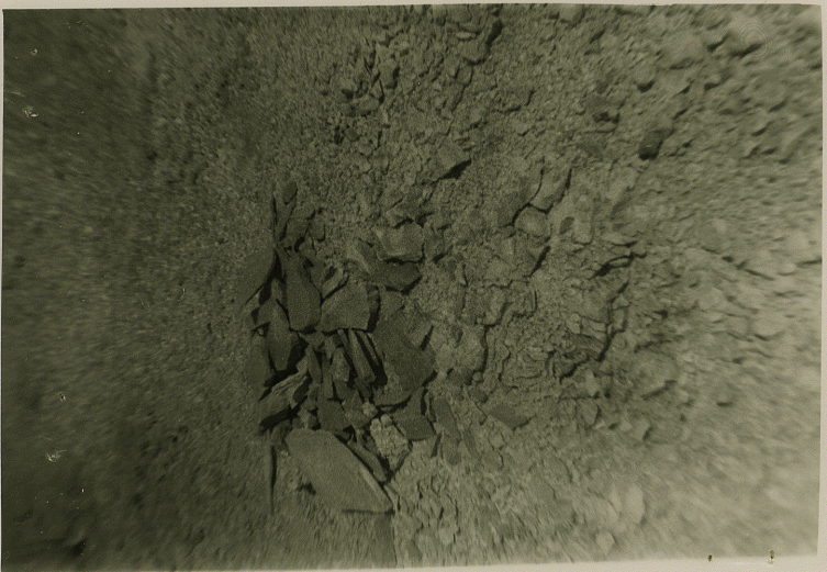
STUDER'S SAN ANTONIO