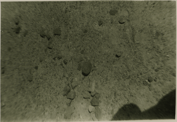
STUDER'S SAN ANTONIO