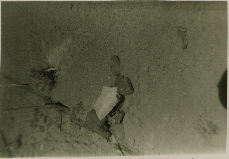
STUDER'S SAN ANTONIO