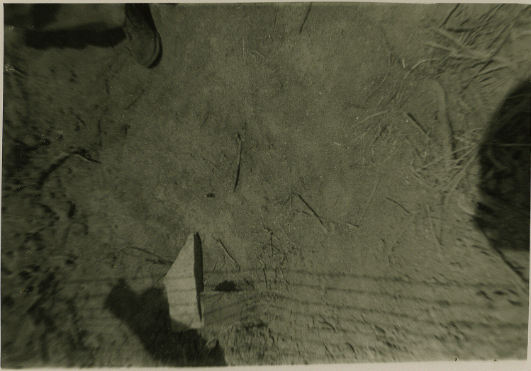
STUDER'S SAN ANTONIO