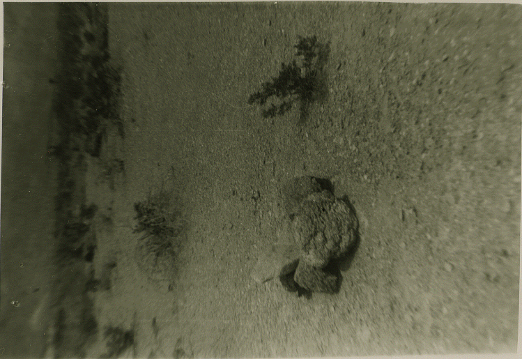
STUDER'S SAN ANTONIO