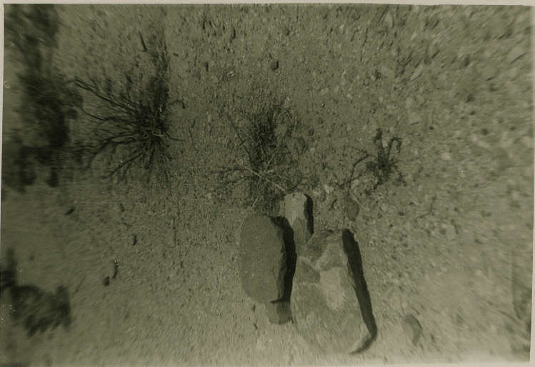
STUDER'S SAN ANTONIO