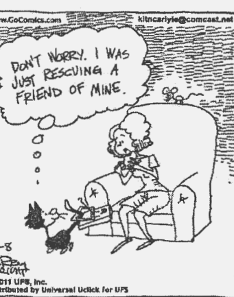
© 2011 UPS, Inc. Distributed by Universal Uclick for UPS