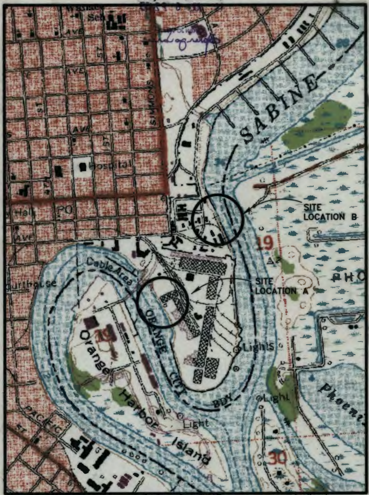
Exhibit 'A' Project Site Location

TEXAS GENERAL LAND OFFICE Mt. 33.136, Natural Resources Code Co. Orange, Report No. 3 File Date Feb 3, 2012 by DJH