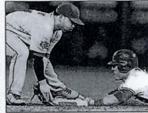
American League's Mike Trout, of the Los Angeles Angels, steals second base against National League's Jose Altuve, of the Houston Astros, during the sixth inning of the MLB All-Star baseball game on Tuesday in Kansas City, Mo.

"For those guys to go out and score five runs in the first inning was definitely a little more relaxing for me," he said. "But I still tried to stay focused."