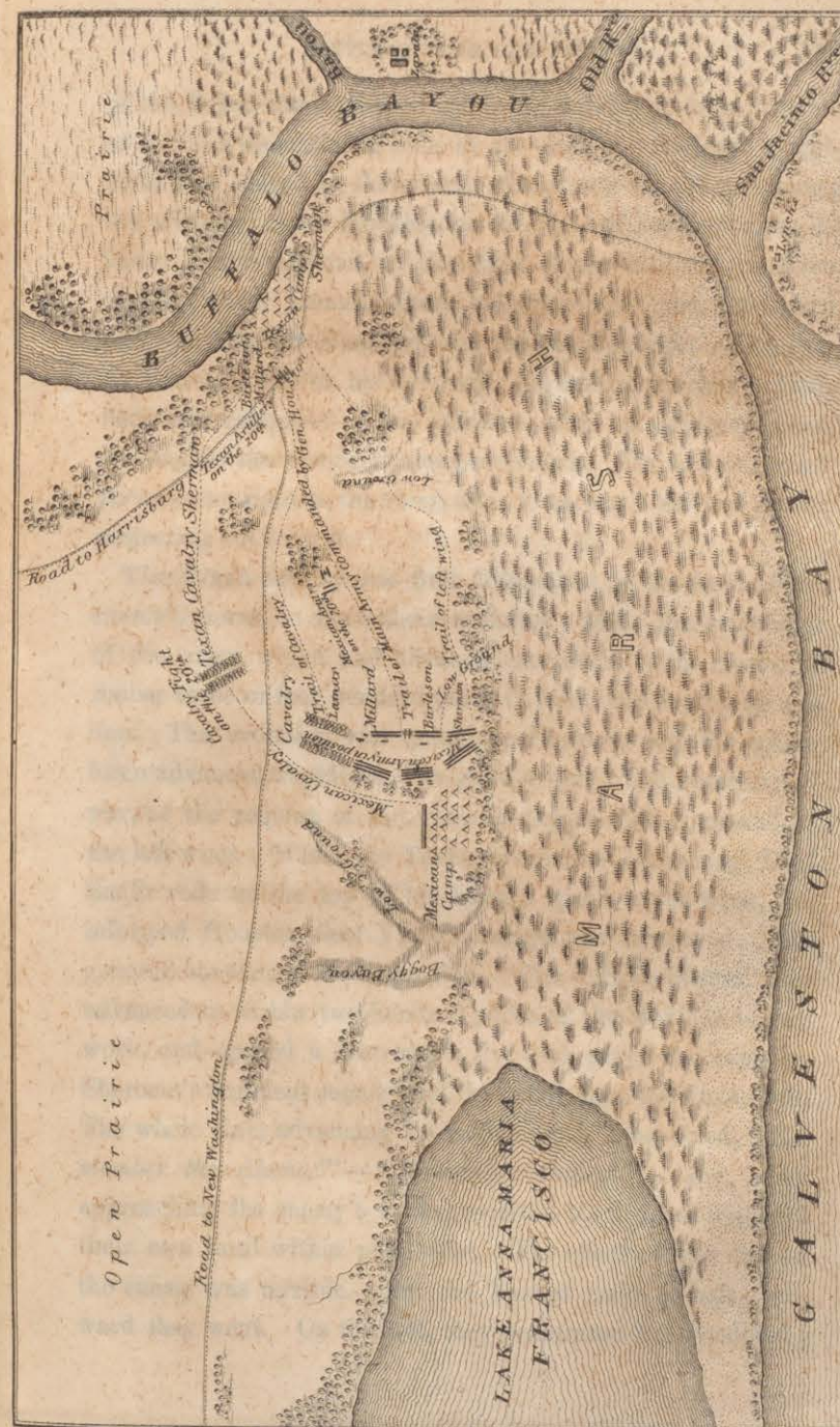
SAN JACINTO BATTLE-GROUND.