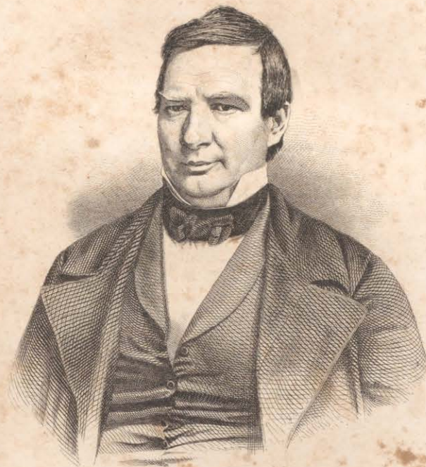
Daguerreotype by Brady