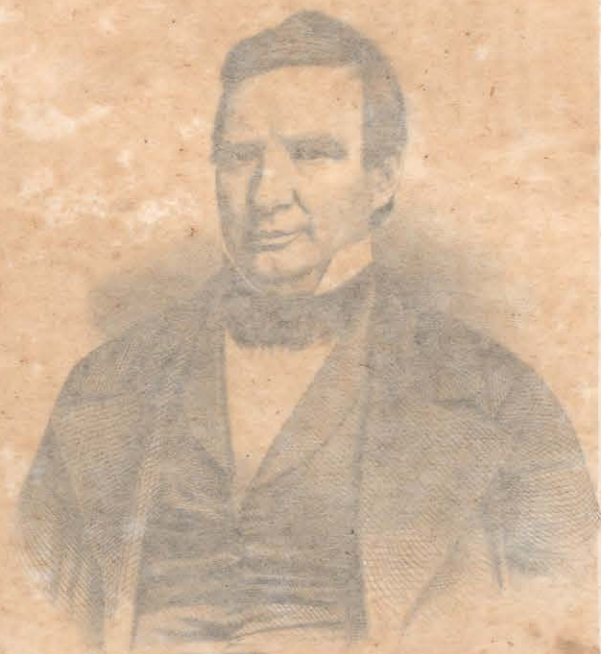
Thomas J. Rusk