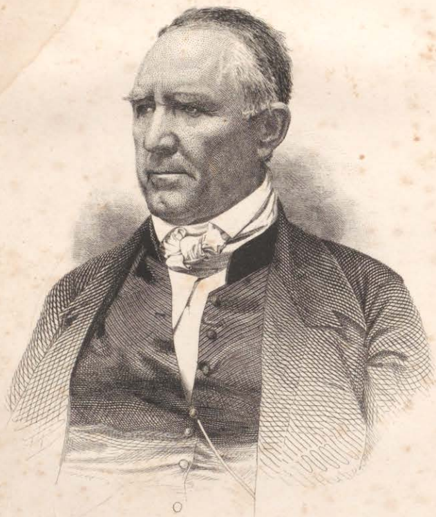
Daguerreotype by Brady